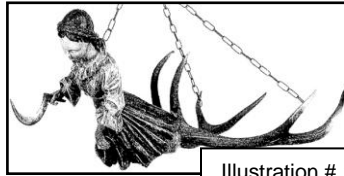
Illustration # 1

Horn and wood go together like butter and bread or hearts and flowers. Long ago, 16 th Century German artisans used these elements together to craft “Leuchterweibchen” that are carved and painted figures with horns as the tail (a bit like a ship figure-head) and used for lights and decorations. Earlier whip holders often resembled these objects