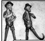
Illustration # 2

because they were carved and painted as well. (See illustrations # 1 & 2). Although, the most popular ones being the carved whimsical holders from the late Victorian times.