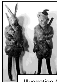
Illustration # 3

(See illustrations # 3 & 4). Sometimes, musical boxes were inserted with a variety of different switches.